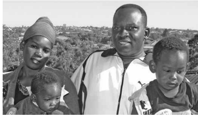
A priority for refugees arriving in Perth is to find adequate housing

Centrecare is well aware of how difficult it is to house people as it finds it almost impossible to find accommodation for humanitarian refugees arriving in Perth. Young adults, even those with well paid jobs, can only afford to rent if they share accommodation with friends and their dream of buying a house is fast receding.