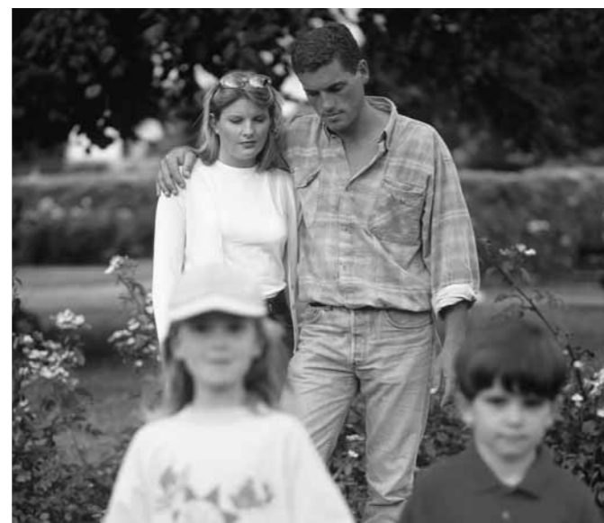
Centrecare reaching out to families in crisis

Editors note : Centrecare is one of the leading agencies which assists people find emergency, short-term or low cost housing. This agency is able to reach out and help 25,000 Western Austrians each year... thanks to your continuing and generous support of LifeLink.